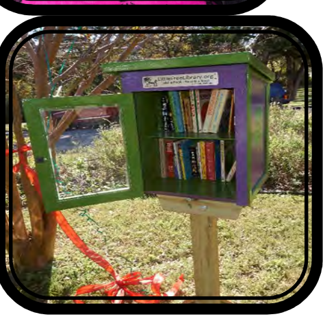
Wynnewood North Little Free Library Charter #45465 Https://littlefreelibrary.org