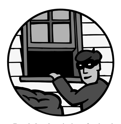
Don't be the victim of crime!

Please be very mindful of activities in the neighborhood at all hours! Report ANY suspicious persons or activity by calling 911. We suspect that the same persons may be involved in many of these crimes, and we want to catch them and stop the activity. Keep your doors locked, and your house and yard well lighted.