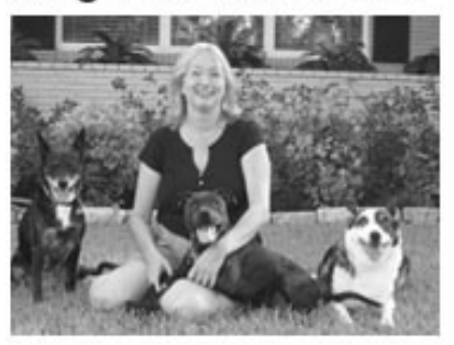
Results You Can Trust