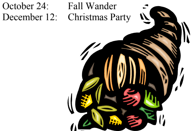
Check our website

October 22: General Neighborhood Meeting